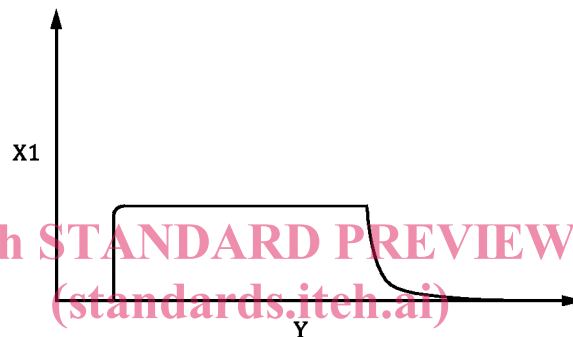
b) Inert gas (constant flow)

https://standards.iteh.ai/catalog/standards/sist/ee49c23-7d0c-41f2-a123-2603a1bdf028/osist-pren-iso-21805-2021