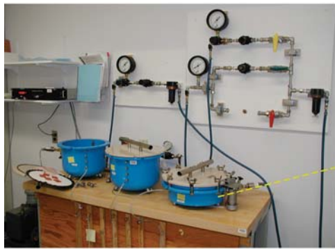
(a) Test assembly