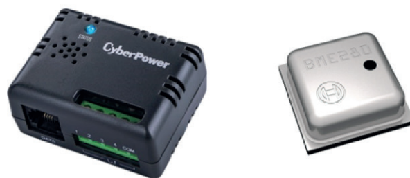
Figure 6 — Environment sensors

An environment sensor measures and represents earth surface characteristics and supports the information requirements for effective environment management (Figure 6). As a system, the Earth's environment comprises a collection of interdependent elements such as lithosphere, hydrosphere, biosphere, and atmosphere. A single instrument can be used to measure liquids and solids, and granular, slurry or open-channel flow without changing the transducer. Environment sensors can detect dust, gas, humidity, ambient light and weather.