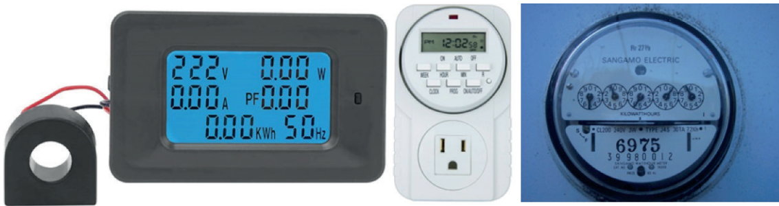
Figure 5 — Electric sensors

An electric sensor is a manually or automatically operated electrical switch designed to protect an electrical circuit from damage caused by overload or short circuit (Figure 5). Its basic function is to detect a fault condition and interrupt current flow. Unmanned security system and RFID sensors are included.