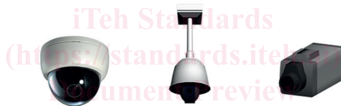
Figure 3 — Camera sensors

This sensor type integrates real world camera and images into a 3D virtual world. A camera sensor is represented as a camera device that converts an optical image into an electronic signal. It is used for digital cameras, phone cameras, camera modules, and other imaging devices, including CCTV ( Figure 3 ). An abstract data model concerning the visual, functional, and physical properties of this sensor type should be defined to represent and simulate them in a 3D virtual world.