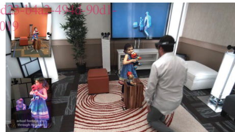
c) An LAE interacting with a virtual object in a 3D virtual world[5]