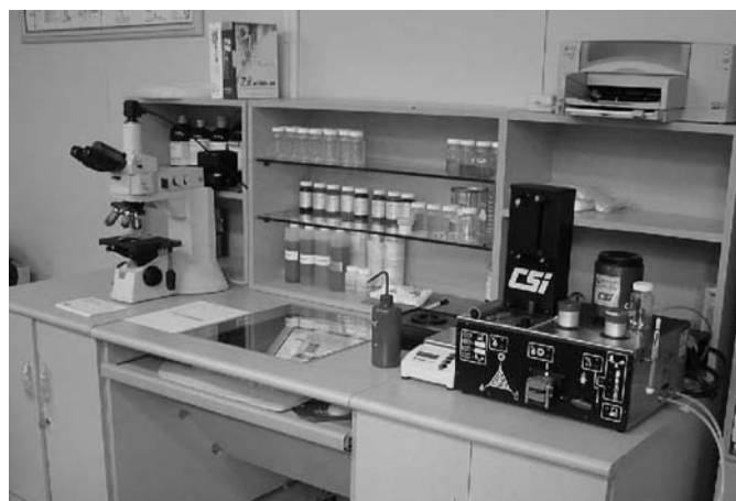
FIG. 1 Example of Layout for a Particular Five-Part Integrated Tester