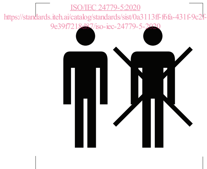
Figure 3 — Single person (IEC 60417-6355A)

This symbol is used at approach/entrance to a facial image capture equipment station to provide instruction that a single person only at a time is allowed, no group is allowed.