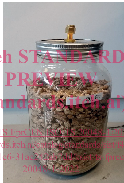
a) Test container of glass with sampling port

The test container(s) shall preferably be made of glass, not plastic, due to the risk of contaminating gases from plastic materials at higher temperatures. Since the containers shall only be filled to 75 % with biomass to be tested, it is an advantage to be able to see the level of biomass from the outside. Figure 1 a) to 1 c) show photos of the test container with sampling port and Figure 2 shows a schematic of the test container and sampling port.