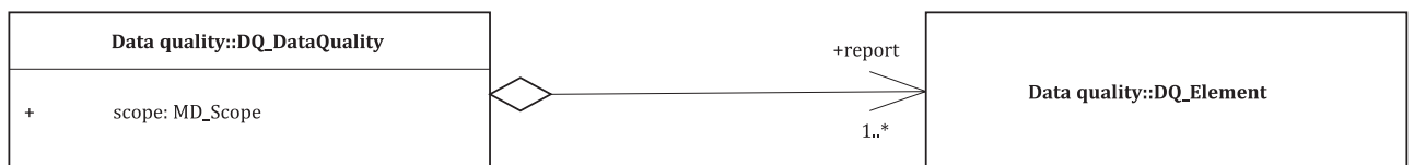
Figure 2 — Data quality unit

Different quality elements and different subsets of the data may be considered when describing the quality of geographic data. In order to describe these, data quality units are used. A data quality unit is the combination of a scope and data quality elements. Figure 2 describes a data quality unit.