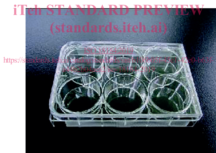
Figure 2 — 6 wells plastic plate for plaque assay

6 wells plates with other sterilization finish may be used after appropriate validation for the growth of cells. See Figure 2 .