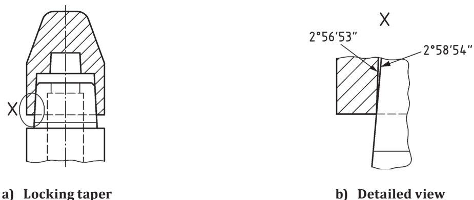
Figure 1 — Principle of a locking taper

Note 3 to entry: During welding, the electrode cap tightens further on the electrode holder.