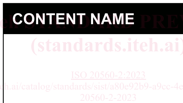
Figure 2 — Example of a safety information system displaying the basic identification colour with content name

When using the basic identification colour, it shall be on the entire top of the safety information system behind the content name. The content name shall be displayed in the contrast colour on the basic identification colour area. See Figure 2 .