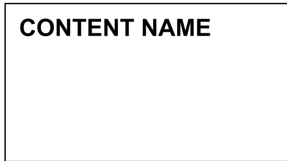
Figure 1 — Example of a safety information system displaying the content name

The content name shall be the contrast colour, black, on a white background, except when using the basic identification colour as defined in Annex B, Table B.1 . For more information about the use of the basic identification colour, see ISO 20560-1:2020, 5.3. The safety colour yellow, warning of hazardous content in piping systems, should not be used as a contrast colour to the content name.