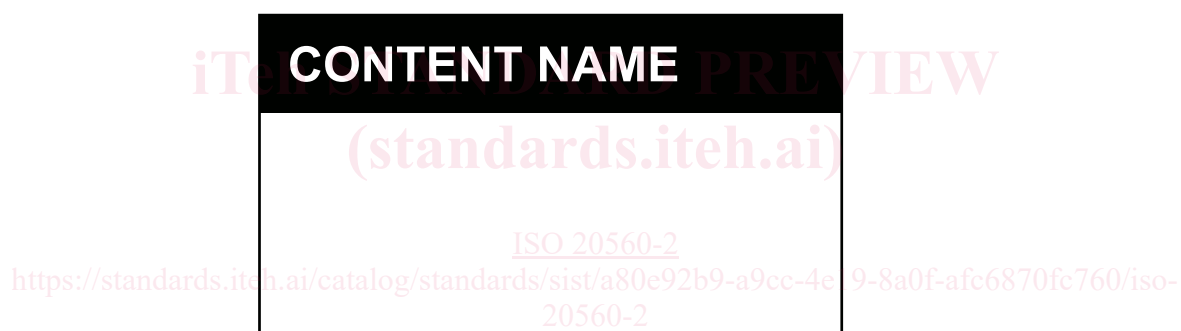
Figure 2 — Example of a safety information system displaying the basic identification colour with content name

When using the basic identification colour, it shall be on the entire top of the safety information system behind the content name. The content name shall be displayed in the contrast colour on the basic identification colour area. See Figure 2 .