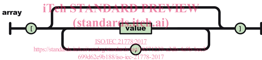
Figure 3 — array

An array structure is a pair of square bracket tokens surrounding zero or more values . The values are separated by commas. The JSON syntax does not define any specific meaning to the ordering of the values . However, the JSON array structure is often used in situations where there is some semantics to the ordering.