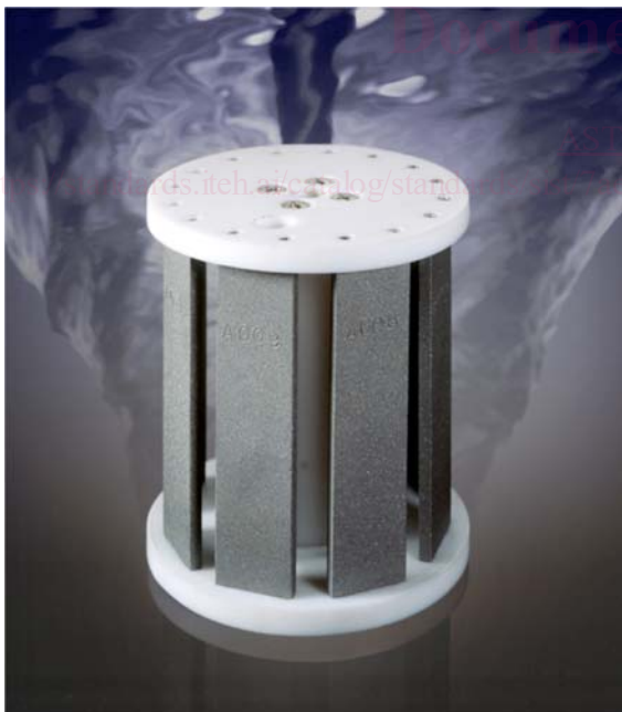
FIG. 2 Photo of Rotating Cage Containing Coupons—Gaps (Typically 0.85 \pm 0.01 cm) between the Coupons Introduce Localized Turbulence

stress of the field is first determined. Based on the wall shear stress the rotation speed is calculated. The relationship between rotation speed and wall shear stress is described in Guide