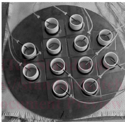
FIG. 4 Test Cells on Hot Plate

(http://standards.iteh.ai/catalog/standards/sist/7304b98a-77f2-423e-a209-5a9b6e5ed06b/astm-c1617-09 Document Preview)