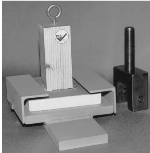
FIG. 1 Tensile Strength Test Specimen Assembly

(18.3-mm)- thick U.S. Product Standard PS-1-95 grade marked stamped, commercial plywood, Exterior, Group 1 Species, A-A or A-B grade face and back veneers.