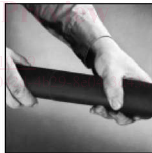
FIG. 2 Apply Adhesive to all Butt Joints Installed/Existing Pipe Work

the pipe. Allow adhesive to properly set and press seams together at each end – working toward the center. Seal all butt joints, cut outs and termination points with adhesive.