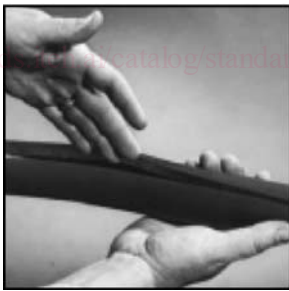
FIG. 3 Apply Unslit Insulation to Straight Pipe

10.4.1 Valves —In all cases, insulate as close to the fitting or valve as possible with straight tubing. Then insulate over or around the fitting or valve by sleeving appropriately sized insulation or flat sheet over the straight sections to create the correct build up of insulation. Seal all cutouts by adhering the insulation (with contact adhesive) to the pipe or body being insulated to prevent air (with moisture) or condensation intrusion into the system. See Figures Fig. 8 and Fig. 9.