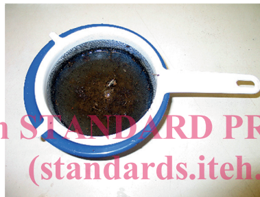
Figure 1 — Extraction bowl with soil sample

NOTE 2 In rare cases, the enchytraeids can be confused with Diptera larvae (which very often possess brownish or black head capsules) or nematodes (non-peristaltic movement; usually smaller and faster moving than oligochaetes). Additionally, fungal hyphae or fine root material can be mistaken for enchytraeids, since they can possess the same length and colour. However, they always lack the segmentation of oligochaete worms.