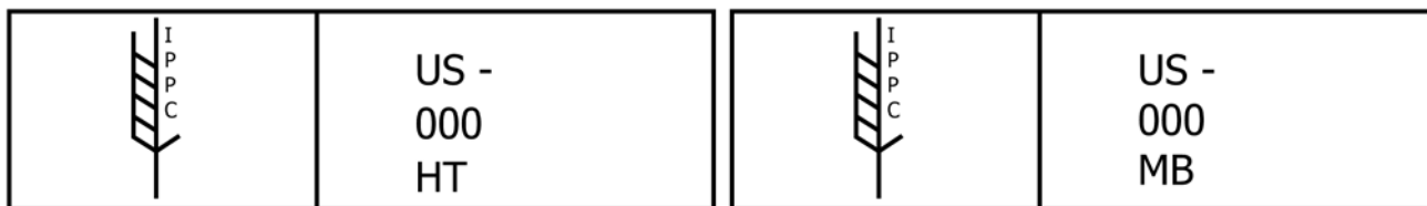
FIG. 1 US Treatment Mark

6.2 Marking Materials —Any specification process, or material used in the marking application, or both, shall be durable enough to be readable for the duration of the pallet’s expected service life.