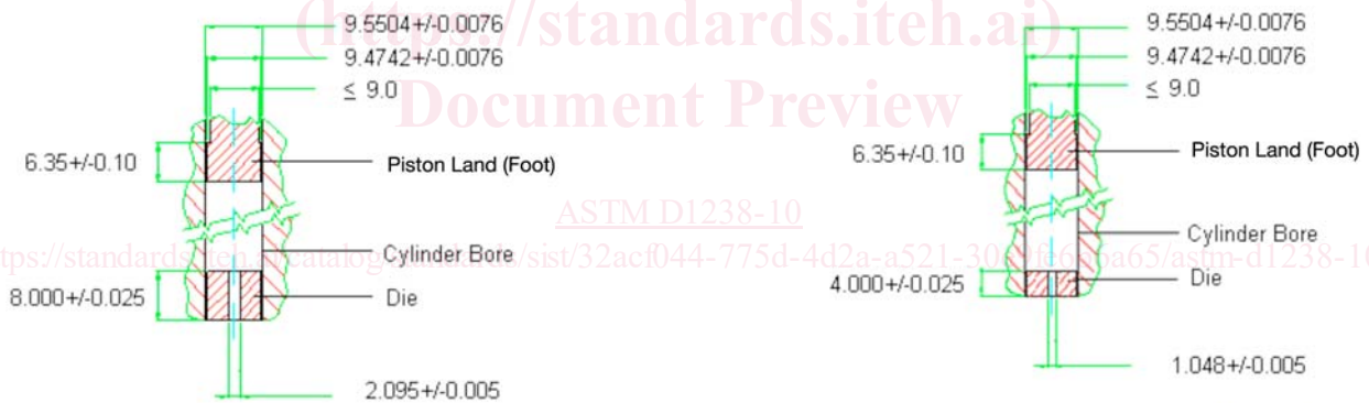
Figure # 2 - Dimensions of the cylinder bore, piston foot & standard die