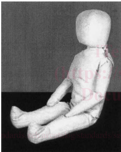
FIG. 2 CAMI Newborn Dummy (7.5 lb, 3.4 kg)