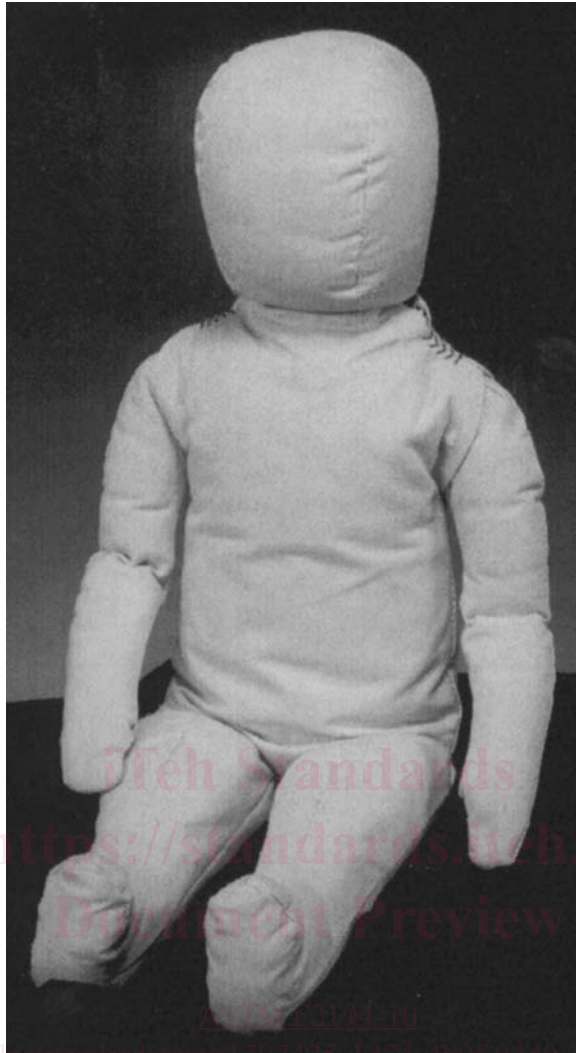
FIG. 1 CAMI Infant Dummy, Mark II 17.5 lb (7.9 kg)