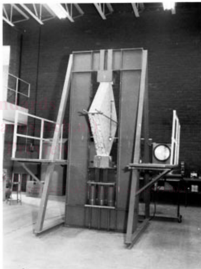
FIG. 1 Apparatus for Determination of Diagonal Tensile or Shear Strength Masonry Assemblages