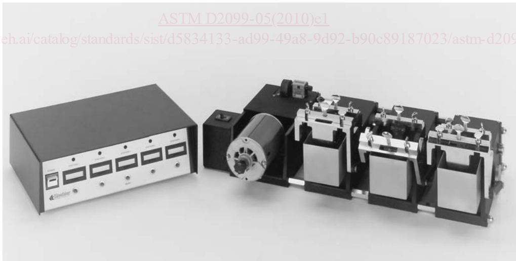
FIG. 1 Maeser Water Penetration Tester (continued)

below this value, the relay will be energized. The high electrode shown is inside the leather specimen in contact with the steel balls. The common electrode is in a salt solution which is in continuous contact with the specimen during flexing.