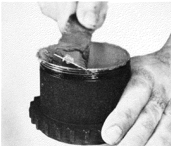
FIG. 2 Preparing Sample for Penetration Measurement

8.2.1.1 Preparing Sample for Measurement —Jar the cup to drive out trapped air and pack the grease with the spatula, with as little manipulation as possible, to obtain a cupful without air pockets. Scrape off the excess grease extending over the rim, creating a flat surface, by moving the blade of the spatula, held inclined toward the direction of motion at an angle of approximately 45^\circ , across the rim of the cup (Fig. 2). This excess grease will be retained to repair the surface for the second and third determinations. Do not perform any further leveling or smoothing of the surface throughout the determination of unworked penetration and determine the measurement immediately.