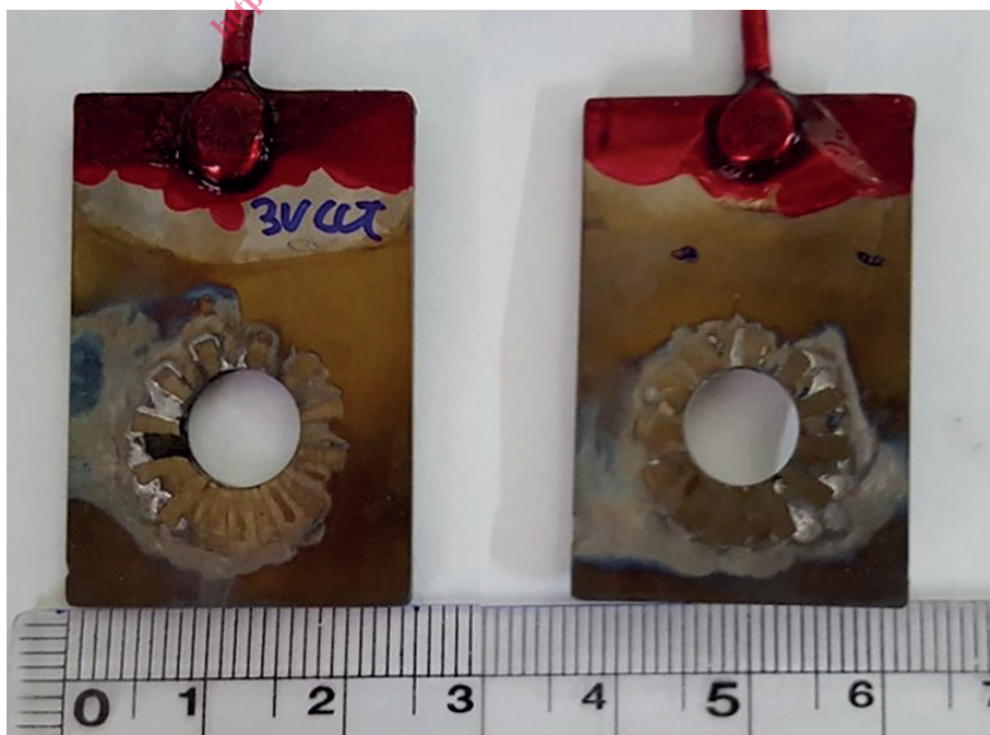
a) Subtractive-manufactured Ti-6Al-4V alloys