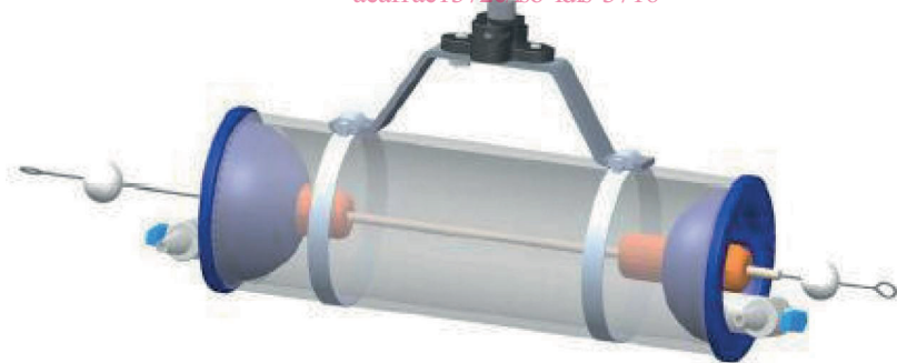
Figure 3 — Van Dorn horizontal sampler

https://standards.iteh.ai/catalog/standards/sist/a6eb7b49-27b8-4f2-a90e-aeaf1ae1372c/iso-fdis-3716