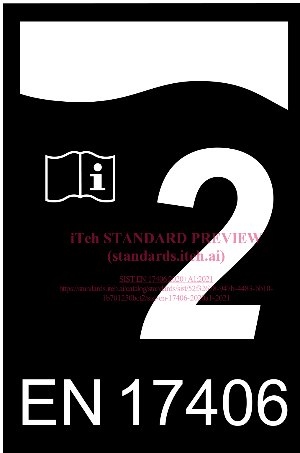
Figure 2 — Label to describe condition 2