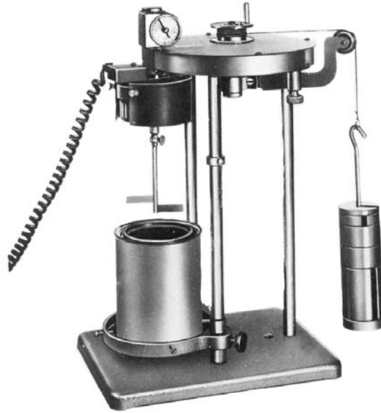
FIG. 1 Stormer Viscometer with Paddle-Type Rotor and Stroboscopic Timer