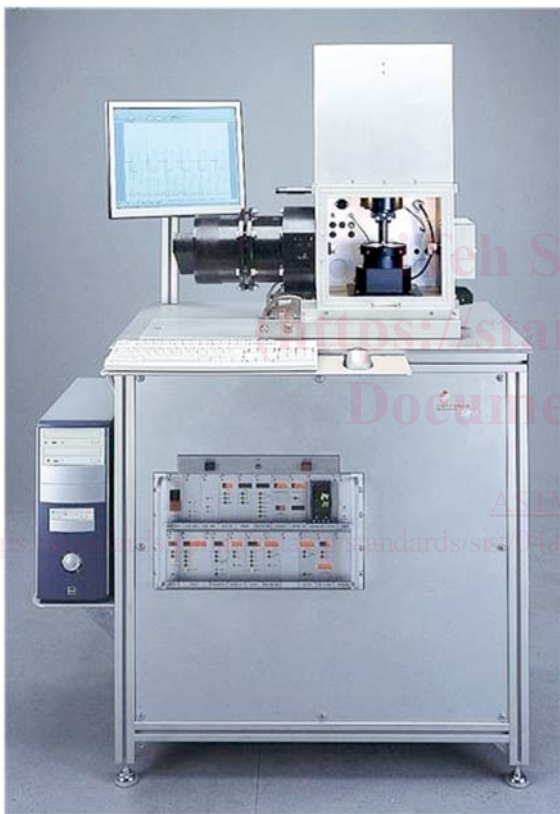
NOTE—Above: Model III; Below: Model IV FIG. 1 SRV Test Machine