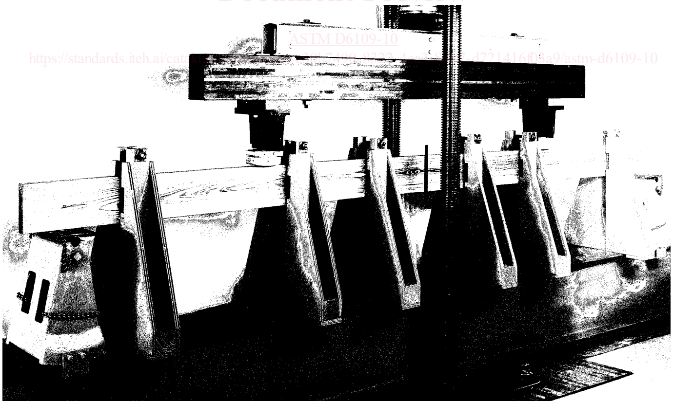
FIG. 3 Example of Lateral Support

10.2.3 Lateral Supports—Specimens tested in the edgewise or “joist” position having a depth-to-width ratio greater than two are subject to lateral instability during loading, especially if the specimen breaks. For stability and safety during the test, lateral supports are needed while testing such specimens. Lateral support apparatus shall be provided at least at points located about half-way between the reaction and the load point. Additional supports shall be used as required to provide necessary stability and safety during the test. Each support shall allow vertical movement without frictional restraint but shall restrict lateral deflection (See Fig. 3).