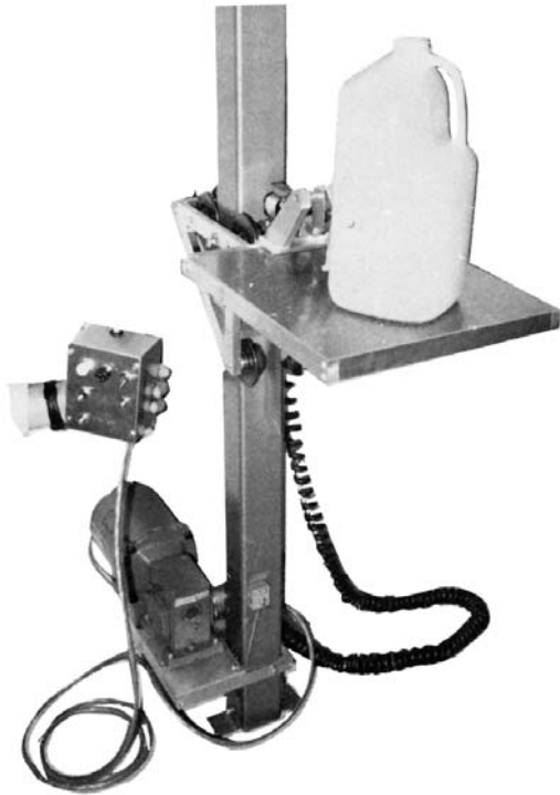
FIG. 1 Apparatus for Dropping Containers