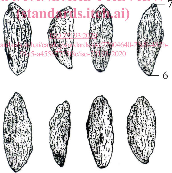
c) Dried ripe fruits (upper: Lycium barbarum fruit; lower: Lycium chinense fruit)

ISO 23193:2020 https://standards.iteh.ai/catalog/standards/sist/904640-23193-3b-57a5-a455871198c/iso-23193-2020