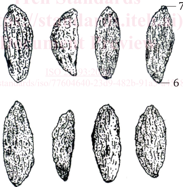
c) Dried ripe fruits (upper: Lycium barbarum fruit; lower: Lycium chinense fruit)