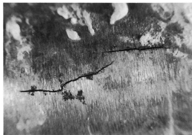
FIG. 2 Typical External Stress Corrosion Cracks (5× Magnification)

8.4 Specimen Holder , for grinding. See Fig. 1.