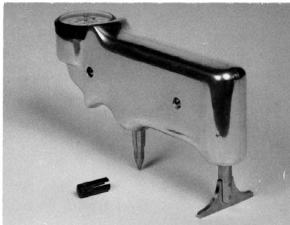
FIG. 1 Barcol Impressor, Model 934-1