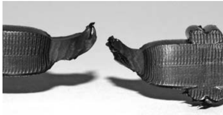
FIG. 2 Ductile Rupture Outside Fusion Interface