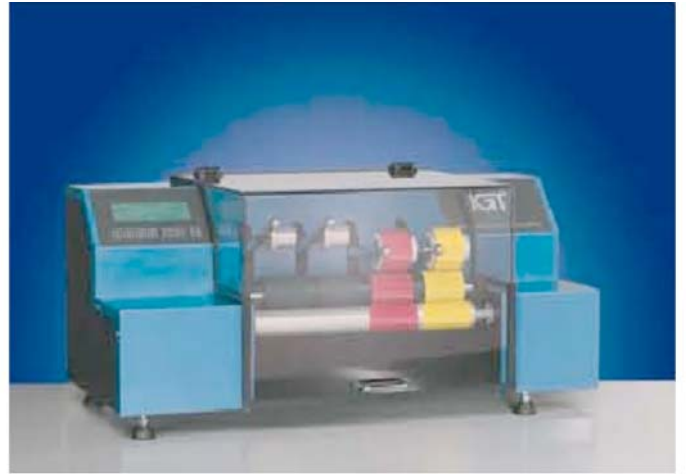
Fig. 2A – High Speed Unit for Tester B