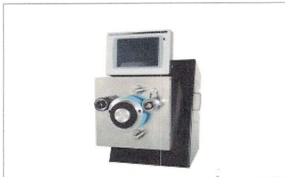
Fig. 1D – Tester D