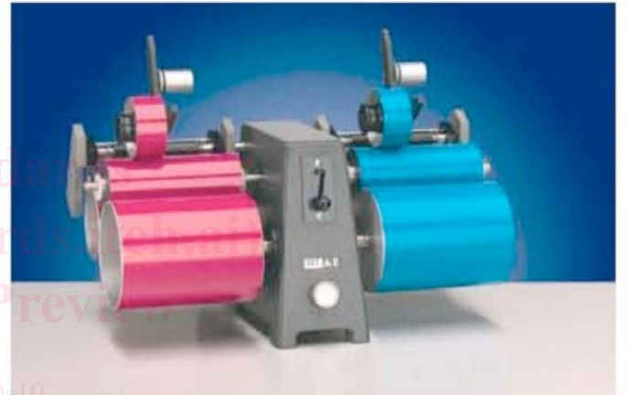
Fig. 2B – Slow Speed Unit for Tester B