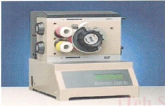
Fig. 1B – Tester B