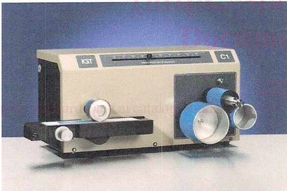
Fig. 1C – Tester C