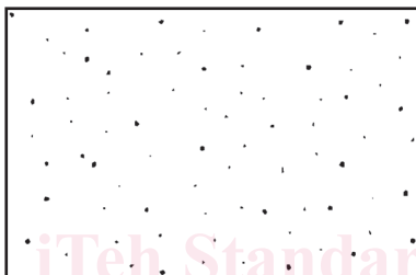
Figure 2 — Severity level 1

Number and size of pores over 100 \text{ mm}^2 (see 5.2): \leq 10 , including: