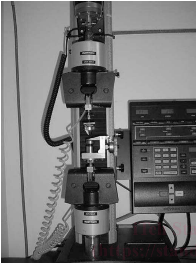
FIG. 2 CRE-Type Tensile Testing Machine setup With Test Fixtures For Option 1.