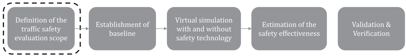
Figure 2 — Overview of the process — Definition of the evaluation objective

Various objectives to conduct safety performance assessments have been identified, [4] the main ones are: