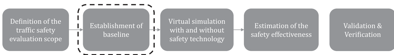
Figure 4 — Overview of the process — Establishment of the baseline

When target traffic situations are identified which address the research question, a detailed, measurable definition of these situations for the upcoming virtual simulations is provided, i.e., the baseline. In general, the prospective safety performance assessment conducts a comparison between traffic situations without and with the technology under assessment. Thus, the baseline refers to the situation without the technology under assessment present. This includes traffic situations that are needed to evaluate both positive and negative performance, according to the evaluation objective. The establishment of the baseline defines the reference to be used in the upcoming simulations and a real-world reference is essential. Figure 4 shows the place in the process overview.