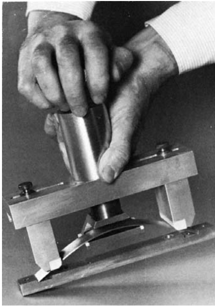
FIG. 2 Stressing Jig and Two-Point Loaded Specimen with Holder (approximately ¼ actual size)

6.3 Deflection Gauges —Deflection of specimens is determined by separate gages or by gages incorporated in a loading apparatus as shown in Fig. 3. In designing a deflection gage to suit individual circumstances care must be taken to reference the deflection to the proper support distance as defined in 10.2 – 10.5.