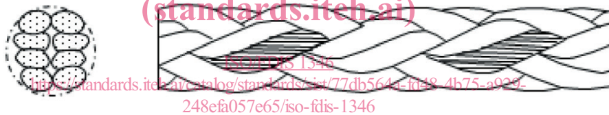
Figure 3 — Shape of an 8-strand braided rope (type L)