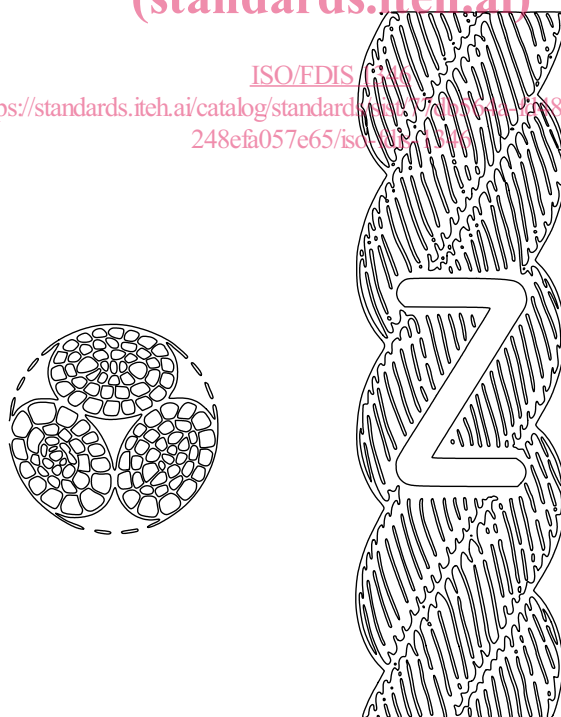
Figure 1 — Shape of a 3-strand hawser-laid rope (type A)

iteh STANDARD PREVIEW (standards.iteh.ai) ISO/FDIS 1346:2021(E) https://standards.iteh.ai/catalog/standards/iso/1346-2021/248-4b75-a929-248efa057e65/iso-1346-2021