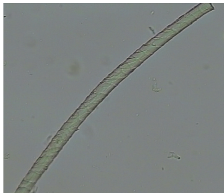
iTeh STANDARD PREVIEW Figure A.1 — Non-medullated fibre (standards.iteh.ai)

The appearance images of typical fibres, including non-medullated fibre, normal medullated fibre and kemp fibre, are given in Figure A.1 to Figure A.4 .