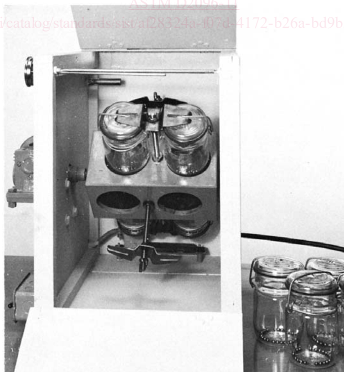
FIG. 1 Washing Machine, Heated Air Bath (Procedure B)