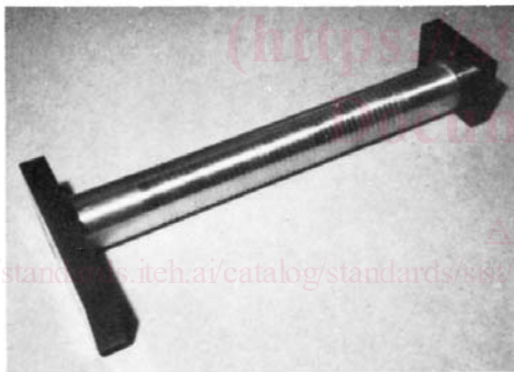
FIG. 1 (a) Leneta Leveling Test Draw-Down Blade

NOTE 1—This is actually a cylindrical rod, the term “blade” being employed as a conventional reference to film applicators. Auxiliary plastic side arms not shown. See Fig. 1 (b) and 1 (c).