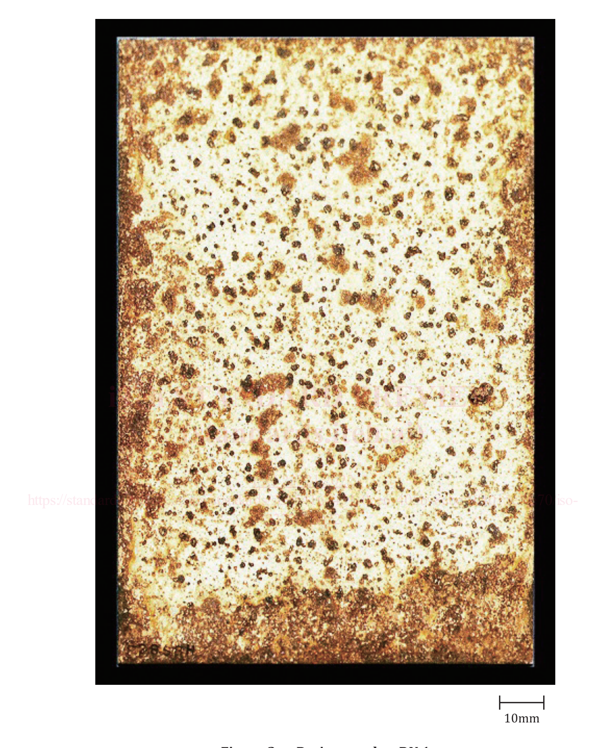
Figure 2 — Rating number RN 1