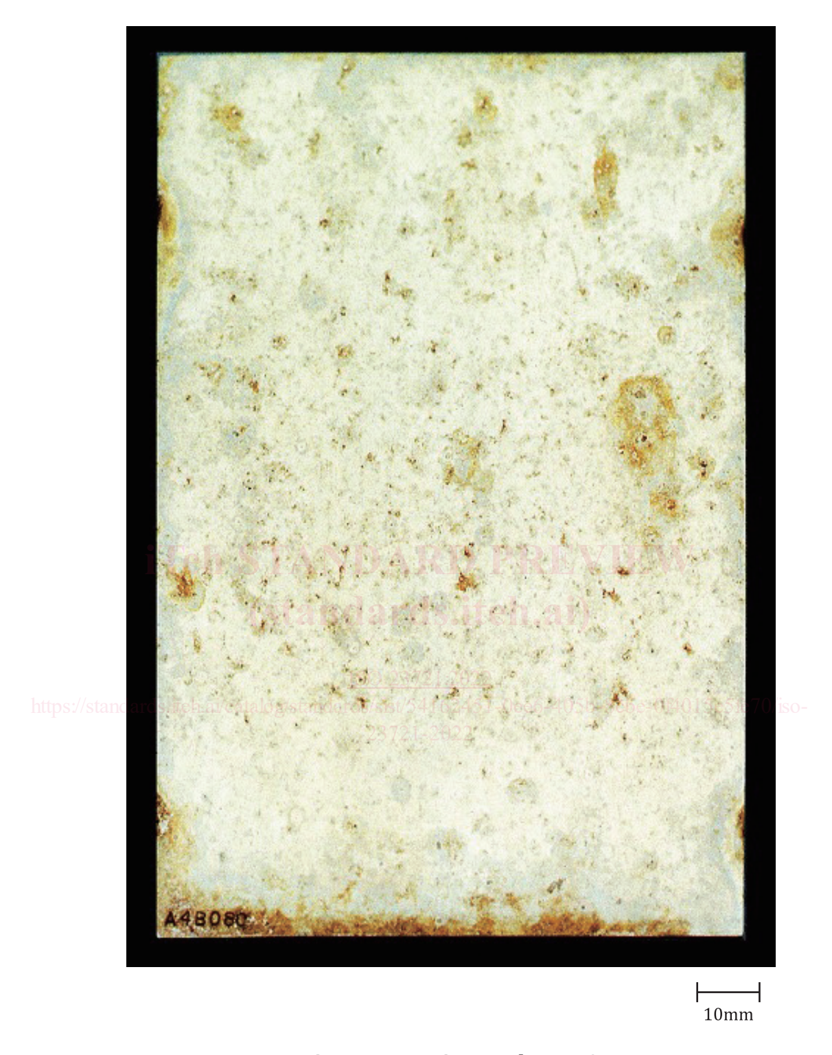
Figure 4 — Rating number RN 3