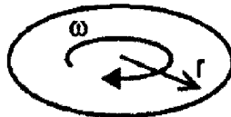
FIG. 2 A Schematic Representation of a Spinning Disk

7.1 Measurement Objective —The major division of detachment assays is between those which measure the adhesion of a population of cells to a surface, with the measured parameter usually being the number of cells left adhering to the surface after