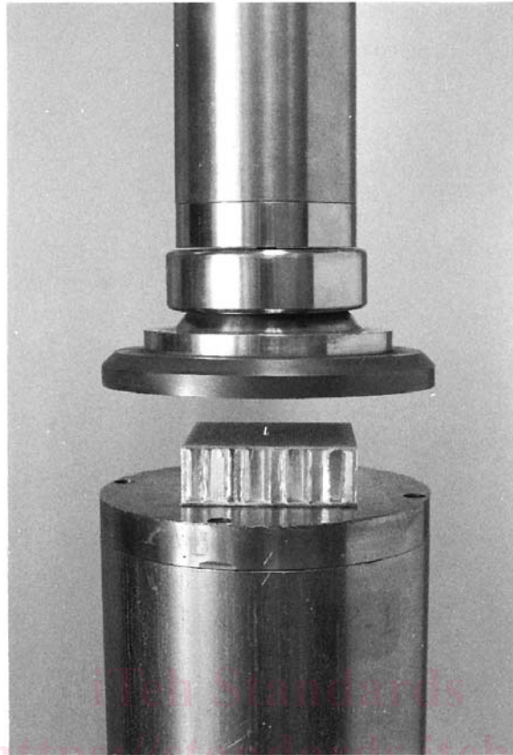
FIG. 2 Close-up of Specimen Between Loading Platens

7.6 Environmental Test Chamber —An environmental test chamber is required for test environments other than ambient testing laboratory conditions. This chamber shall be capable of maintaining the gage section of the test specimen at the required test environment during the mechanical test.