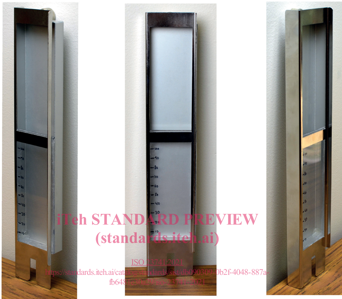
Figure A.2 — Water collection reservoir in a rotating rack xenon arc weathering test apparatus for quantification of water delivery

A.2 An example of a water collection device for a rotating rack xenon arc weathering test apparatus is shown in Figure A.2 .